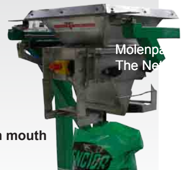
Molenpa The Net