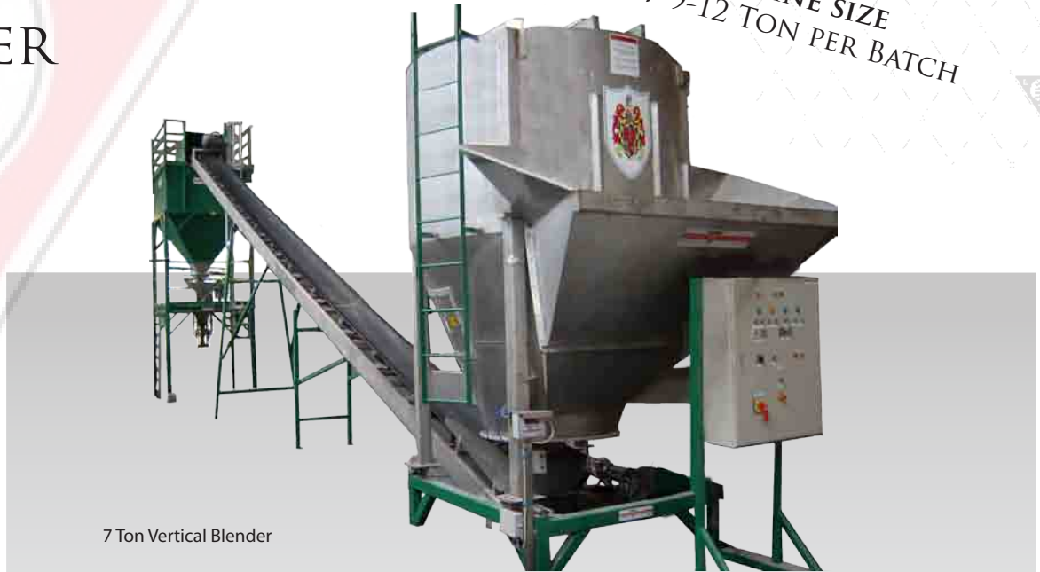
7 Ton Vertical Blender

The Vertical Blender is suitable for powder and granular fertilizers production. The machine processes all raw materials into an excellent blend. When the machine has produced a blend, it can be transported to a bag filling station. The clever design makes it possible for the machine to be installed in space-confined areas.