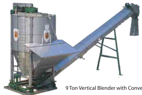
9 Ton Vertical Blender with Conveyor