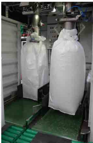
FILLING OF BIG BAGS INSIDE THE CONTAINER