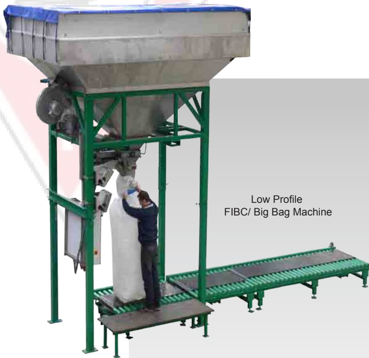
Low Profile FIBC/ Big Bag Machine

CAPACITY: 100 KG TO 1250 KG BAGS 30-40 TON/M 3 PER HOUR 60 BAGS PER HOUR