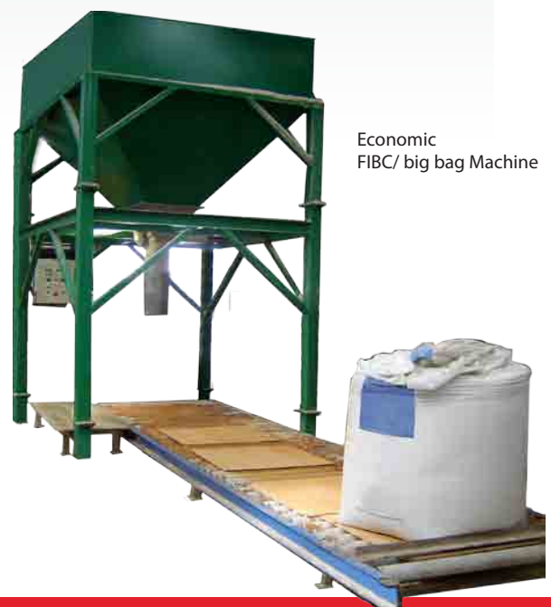
Economic FIBC/ big bag Machine

into the bag. The loadcell platform scale will determine the weight of the product. When the bag is full, a roller conveyor transports the Bag. The scale system works with a weigh indicator of Avery Salter Weightronix. The whole unit can be operated automatic or manual. The unit operates with pneumatic Stainless steel and Fibreglas cylinders. The machine is available in different set up possibilities. The Big bag economic is a fixed machine with a storage hopper above it. The Big bag low profile is a portable machine that can be moved with a forklift. It can be filled with a loader directly into the hopper. The capacities of both systems are 30 ton per hour with big bags of 1000 kg and approx. 50 bags of 500 kg per hour. This product can be adjusted to customer demands.